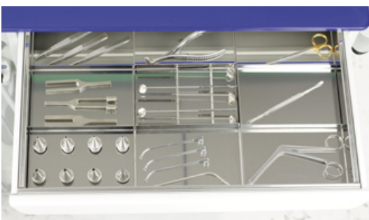
Example of 1st drawer with tray

Support with space for 3 x 8 ear specula .