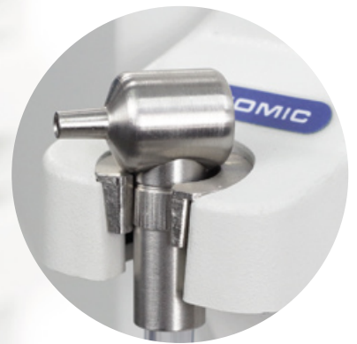
Insufflator nozzle (Only on OTOSMART PLUS model)