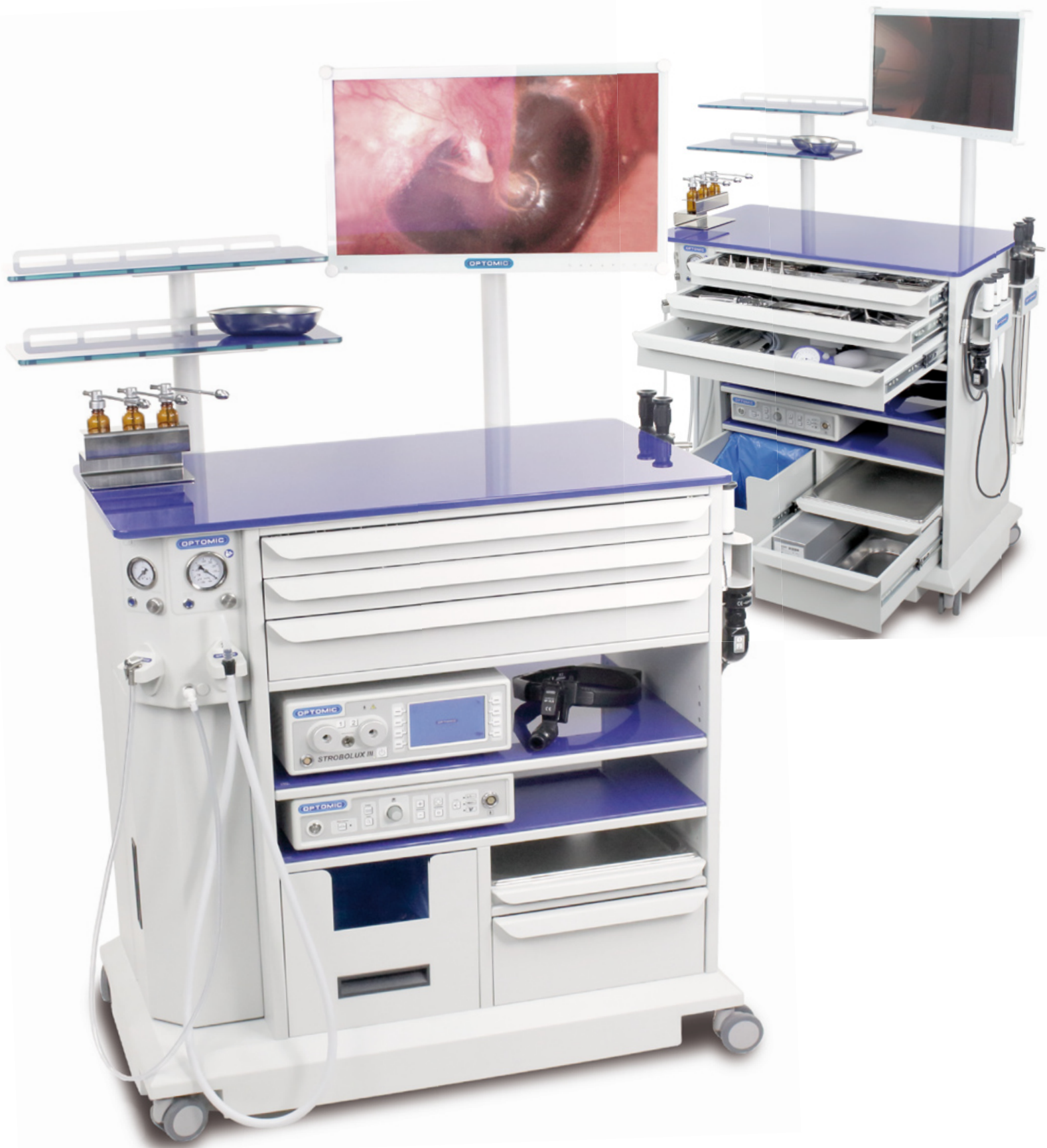
Example of fully equipped OTOSMART PLUS.

“The convenience of having your instruments within hand’s reach. Optimize your space and save precious time with our OTOSMART models”