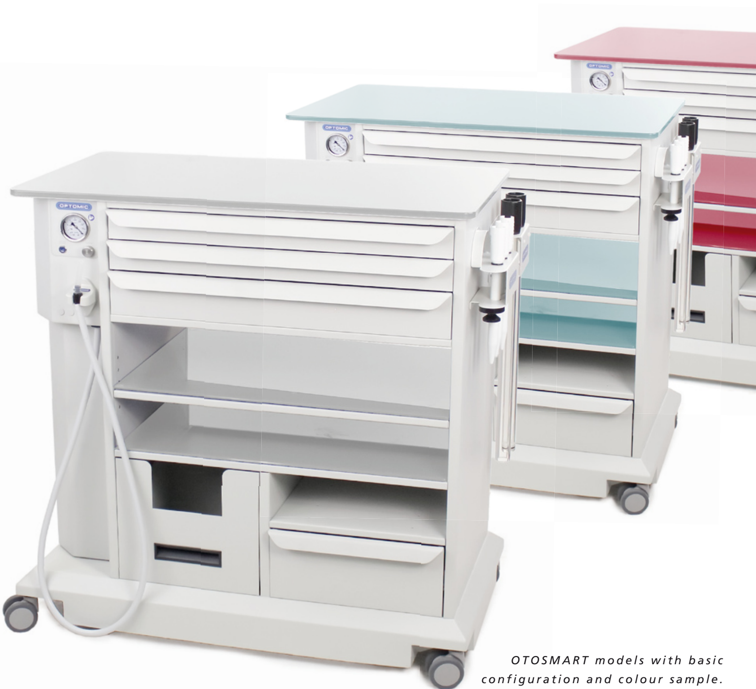
OTOSMART models with basic configuration and colour sample.

Adding the optional monitor, fiberscope, endoscope supports and/or used instruments tray, makes our workstations the most compact unit around.