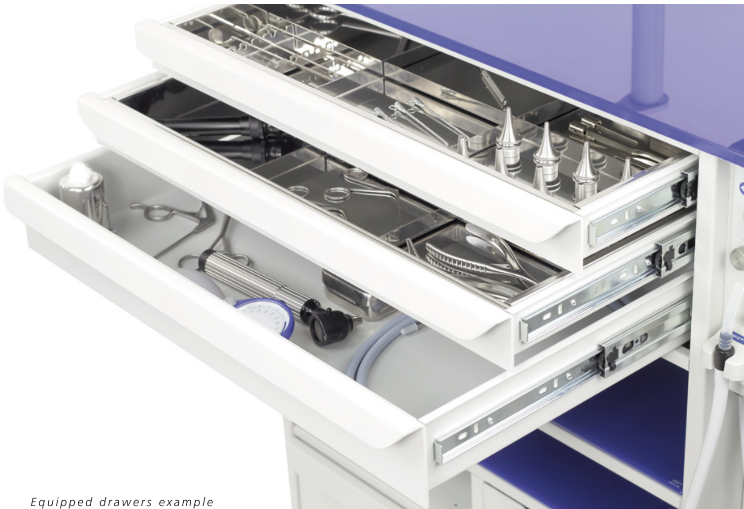
Equipped drawers example