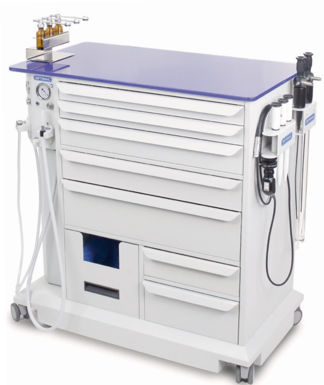
Example of OTOSMART PLUS with optional extra drawers