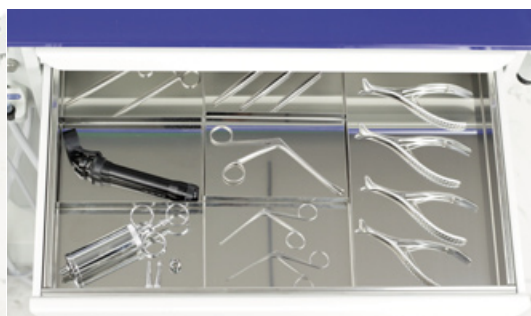
Example of 2nd drawer with tray