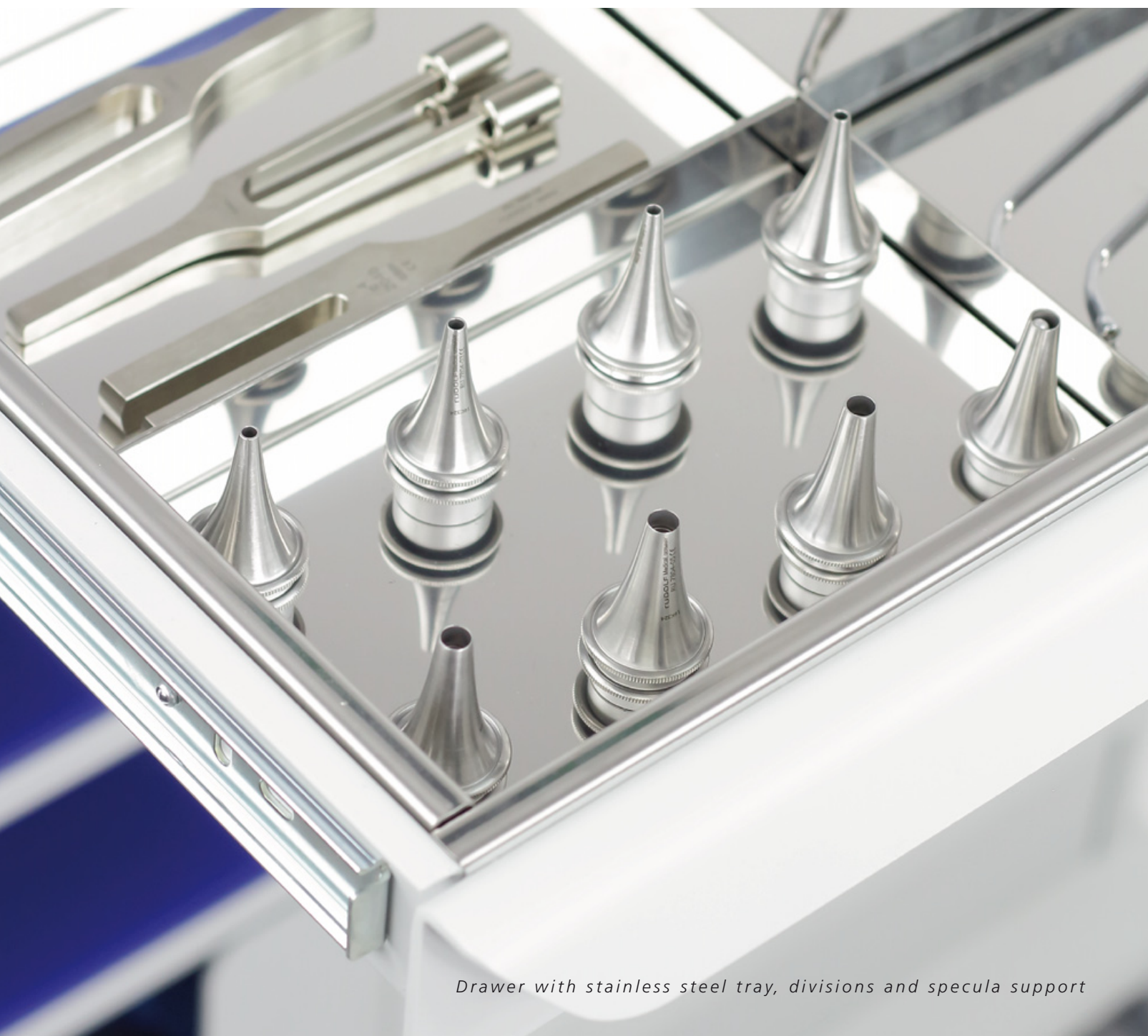
Drawer with stainless steel tray, divisions and specula support

“Space flexibility to achieve perfect organization”