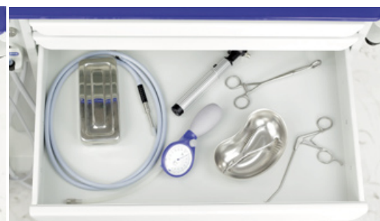
Example of 3rd drawer