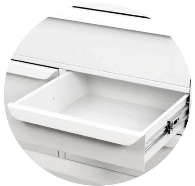
Auxiliary lower drawer