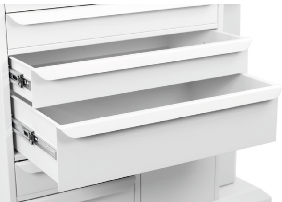
Optional central drawers (complete two drawer module)